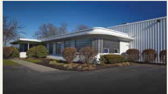
Union City, PA